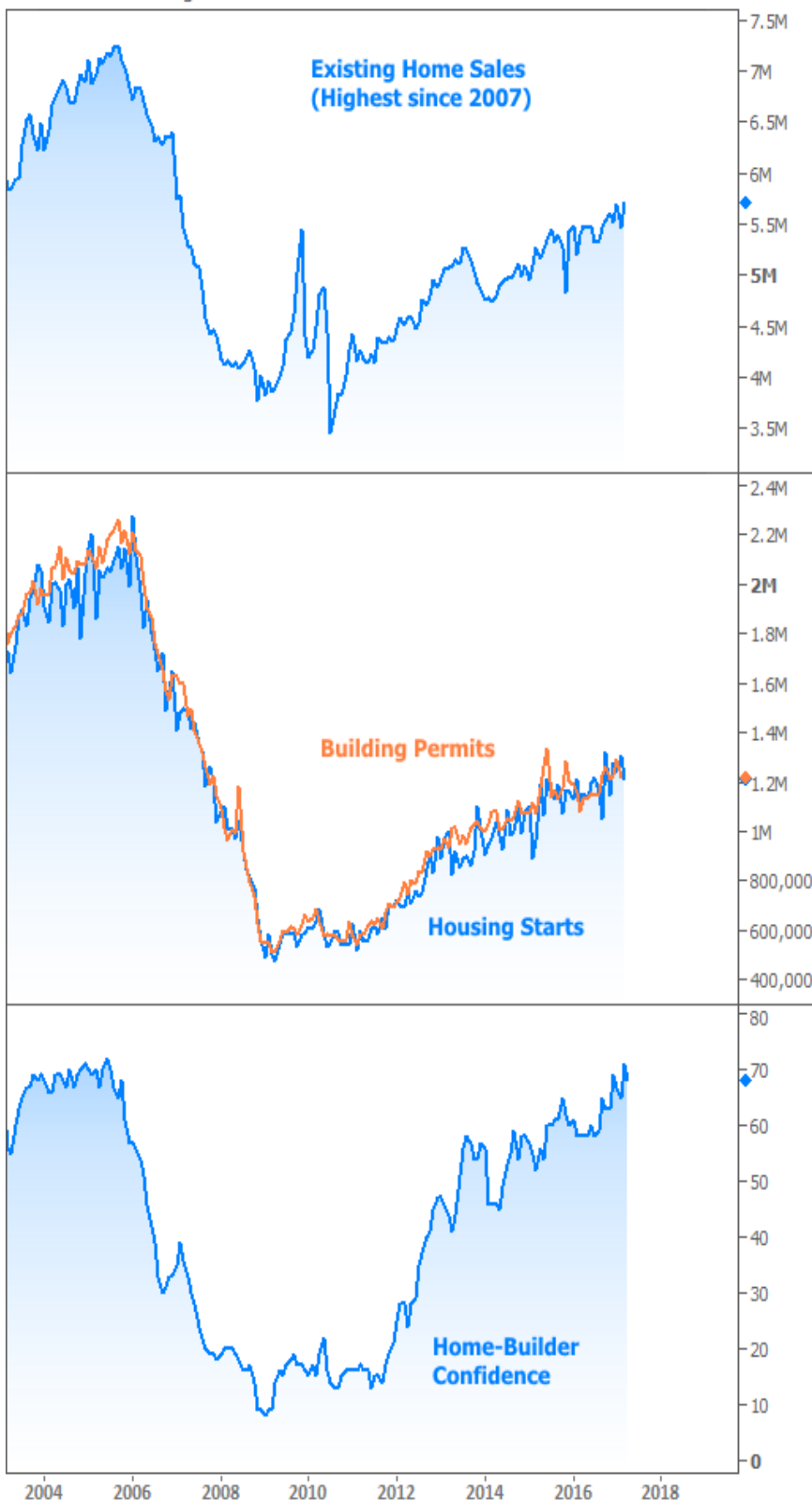
This Week's Housing Data

Subscribe to my newsletter online at: http://mortgageratesupdate.com/statz