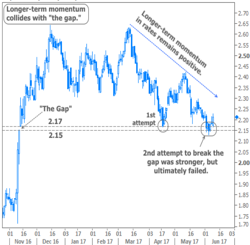
10yr Treasury Yield (Rates)

These sorts of gaps can be significant lines in the sand for investors. This particular gap corresponds to average mortgage rates near 4.0%. As such, 10yr yields will need to break well below 2.15% if we're to see widespread availability of conventional 30yr fixed rates in the high 3 percent range.