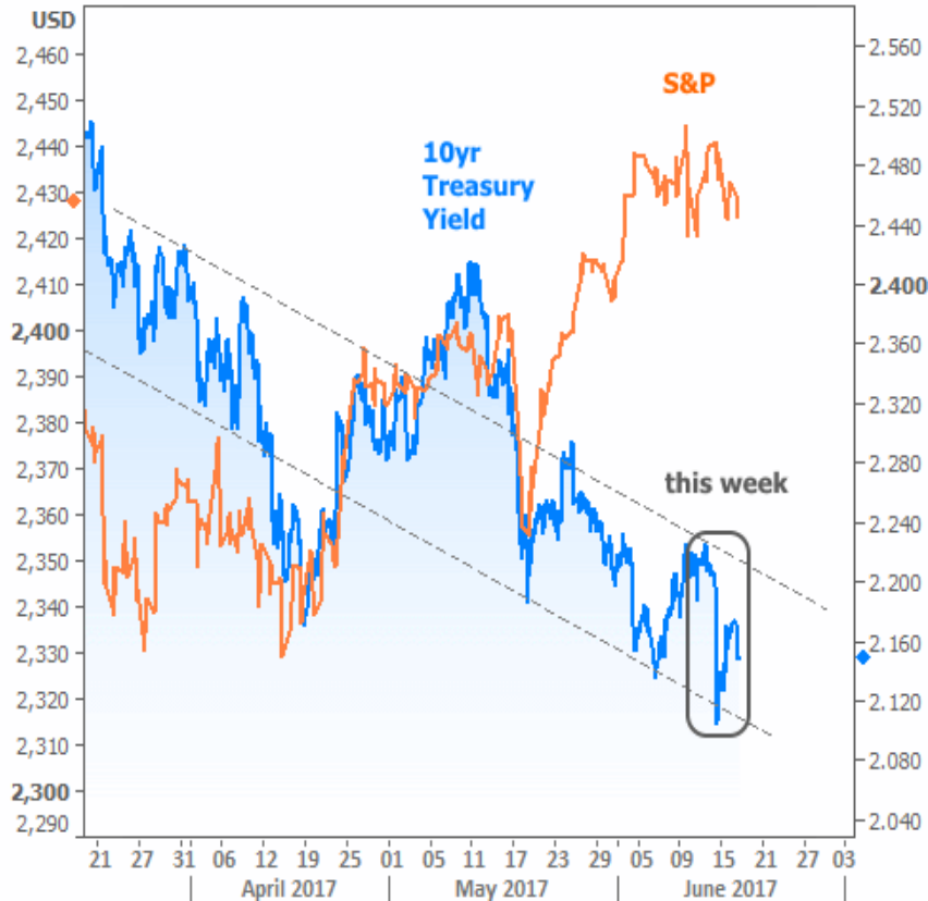
Rate Trend Remains Friendly

In housing-specific news, this week's economic data was generally downbeat . The National Association of Home Builders reported a drop in its Housing Market Index (a measure of builder confidence). In context, however, the index doesn't look like it's in trouble just yet.