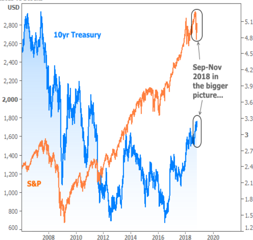
Rates vs Stocks

In the bigger picture, this week's interest rate reaction isn't even a blip on the radar. Rates would need to see A LOT more stock drama in order to reverse the upward trend that's been in place since mid-2016.