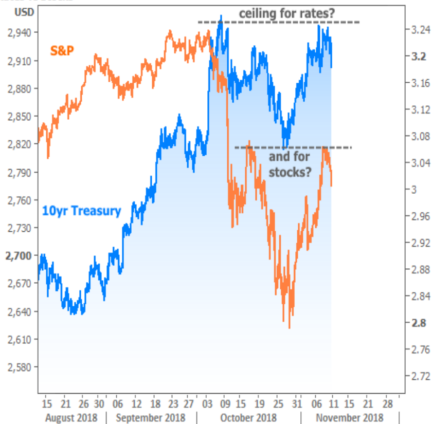
Rates vs Stocks

In the bigger picture, this week's interest rate reaction isn't even a blip on the radar. Rates would need to see A LOT more stock drama in order to reverse the upward trend that's been in place since mid-2016.