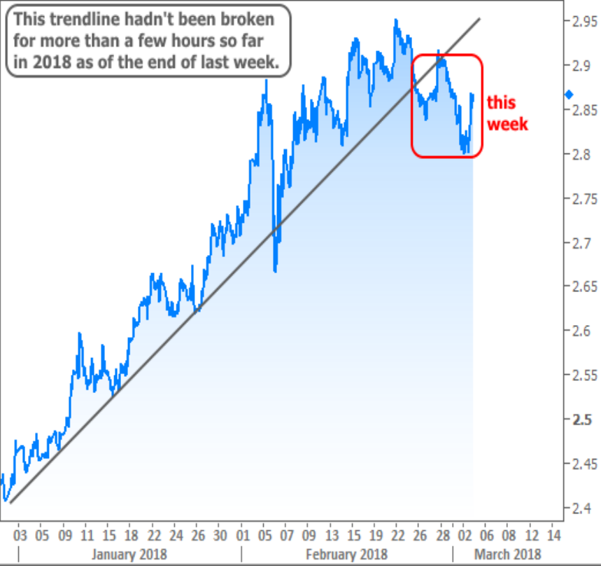
US 10yr Yield ("rates")