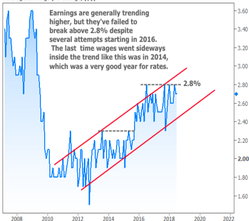
Average Earnings (% Change, y/y)

OK, maybe we should move on. You said something about home sales and glimmers of hope?